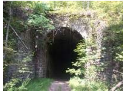
Tunnel near Burnside, KY