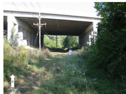
Route of Brighton East RT under I-75, Lexington, KY