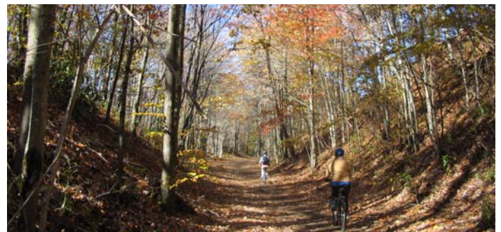
(Virginia Creeper Trail, 10/06)