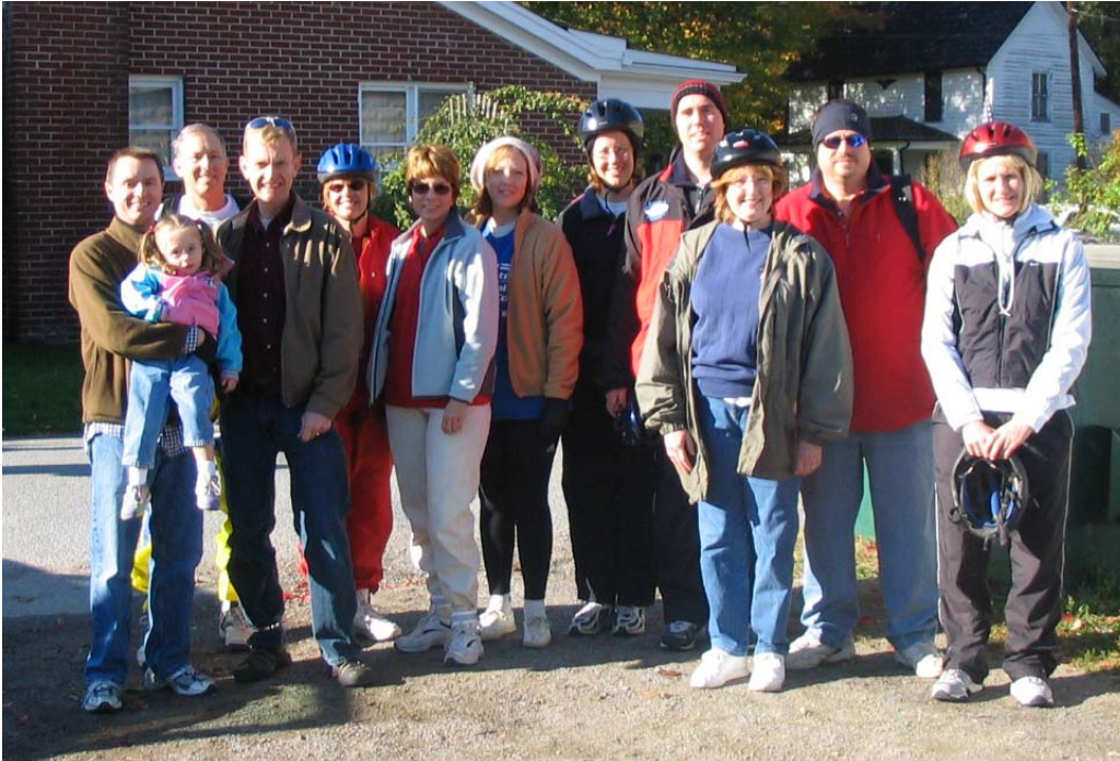
(KRTC Members and supporters on their Trip to the Virginia Creeper,)